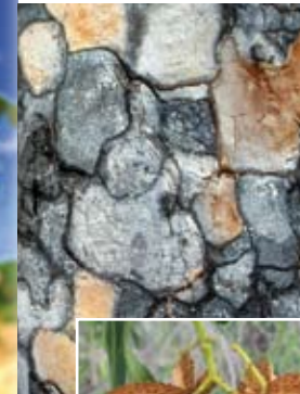
The bark (top) and pod of the Leopardwood tree

Plant communities on the Red Kandosol soils of the ridges are quite different from those of the surrounding black soil plains.