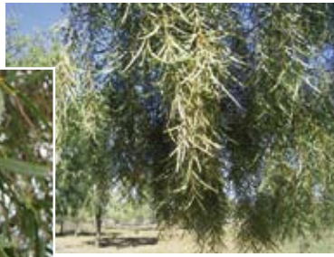
Myall (above); Myall leaves and pods (left)