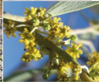
Gidgee tree (top) and flower (left and above)

Site 5 - Black Hand flora site, Three Mile Road (Grid ref. 593403mE, 6740546mN) 28 plant species can be found here. See the plant regeneration project at Lunatic Hill lookout 300m east.