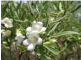
Budda in flower

Site 2 - Quandong Enclosure, Castlereagh Highway (Grid ref. 595094mE, 6736153mN)