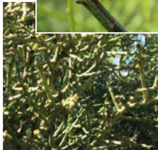
Stiff cherry in flower (left) and fruit (above)

If you continue on to Cumborah and Grawin (60km) you will pass a good example of spinifex/ironbark woodland 3.6 kilometres north of Cumborah.