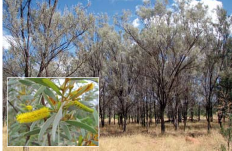
Mulga trees and (inset) Mulga blossom