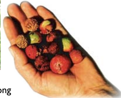
Quandong tree (left), flower and fruit

From here, head 400 metres south and turn right towards Grawin. Look at the Stiff Cherry understory along the southern side of the road for the first kilometre.