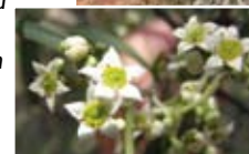
Wilga (above) and in flower (left)